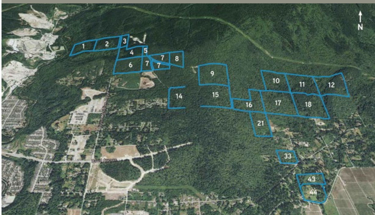
Exhibit 3: Burke Mountain Crown land parcels

We found direct comparability of the bids, based on the price offering for each parcel, was not possible, because government did not require bidders submitting grouped bids to disclose how much they were offering for individual parcels within their grouped bid during the bidding process.